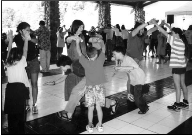
Family dances bring the whole community together