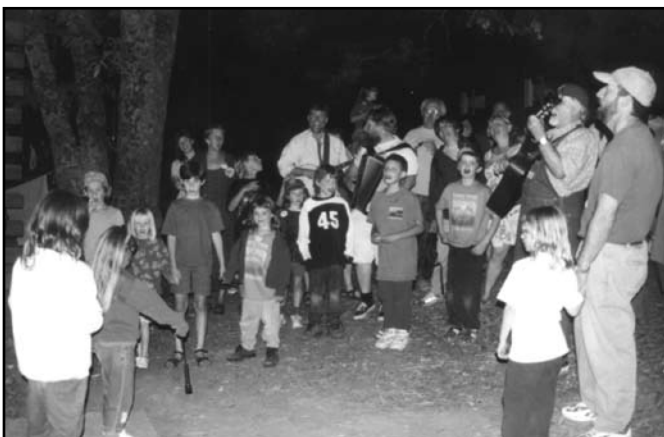
The Pied Piper bedtime serenade parade

Pied Piper: Each evening, after games, dancing, and storytelling, a musical Pied Piper procession leads the younger children (under 10) off to bed, winding through camp to parade them to their own cabins, serenading a good night. Then roving baby-sitters check on them every few minutes, leaving parents free to return to the evening dance.