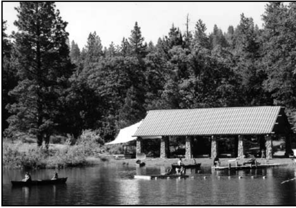
Canoeing on the lake

BACDS FAMILY WEEK was founded in 1992 as a week-long residential music and dance camp for the whole family. Located in a beautiful mountain setting, Family Week is ideal for families, couples, grandparents, and anyone who likes to experience the vibrancy of community with children. The Family Week program is designed for all ages, providing a balance of family time with age-group class time, as well as times we gather together as a community. There are three class periods a day, and two Family Gathering periods when the whole community comes together for dancing, singing, storytelling, humor, and entertainment. There are delicious gourmet meals and refreshments, evening dances for adults and teens, and free time for swimming, canoeing, and the relaxation needed to develop the camaraderie of community.